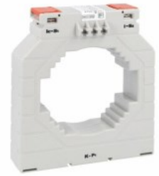
Current transformers DM4T1000